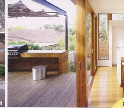
2 / Cooking – indoors and out