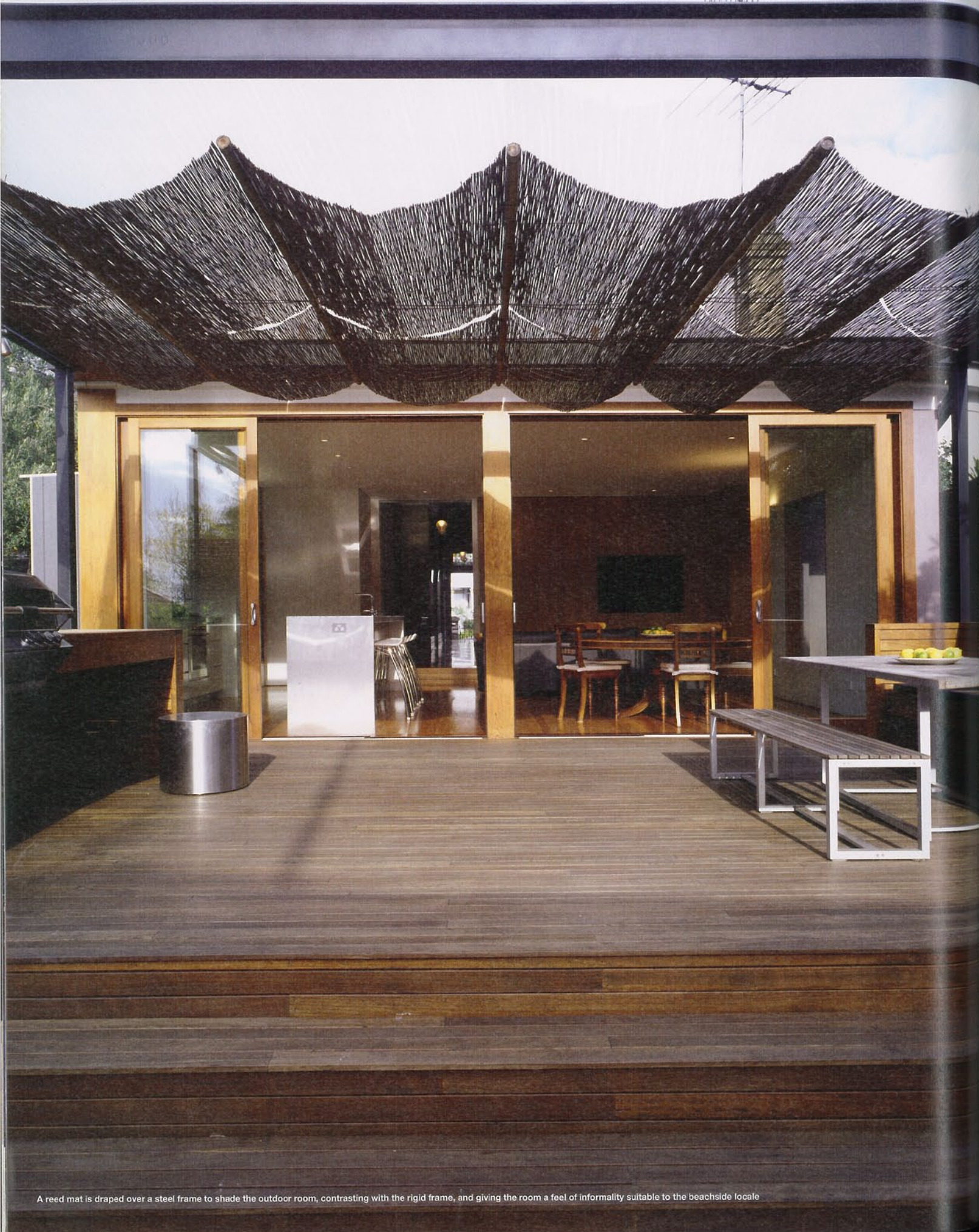
A reed mat is draped over a steel frame to shade the outdoor room, contrasting with the rigid frame, and giving the room a feel of informality suitable to the beachside locale