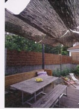
1 / The reed canopy also serves to block views of an unsightly apartment building one block to the east