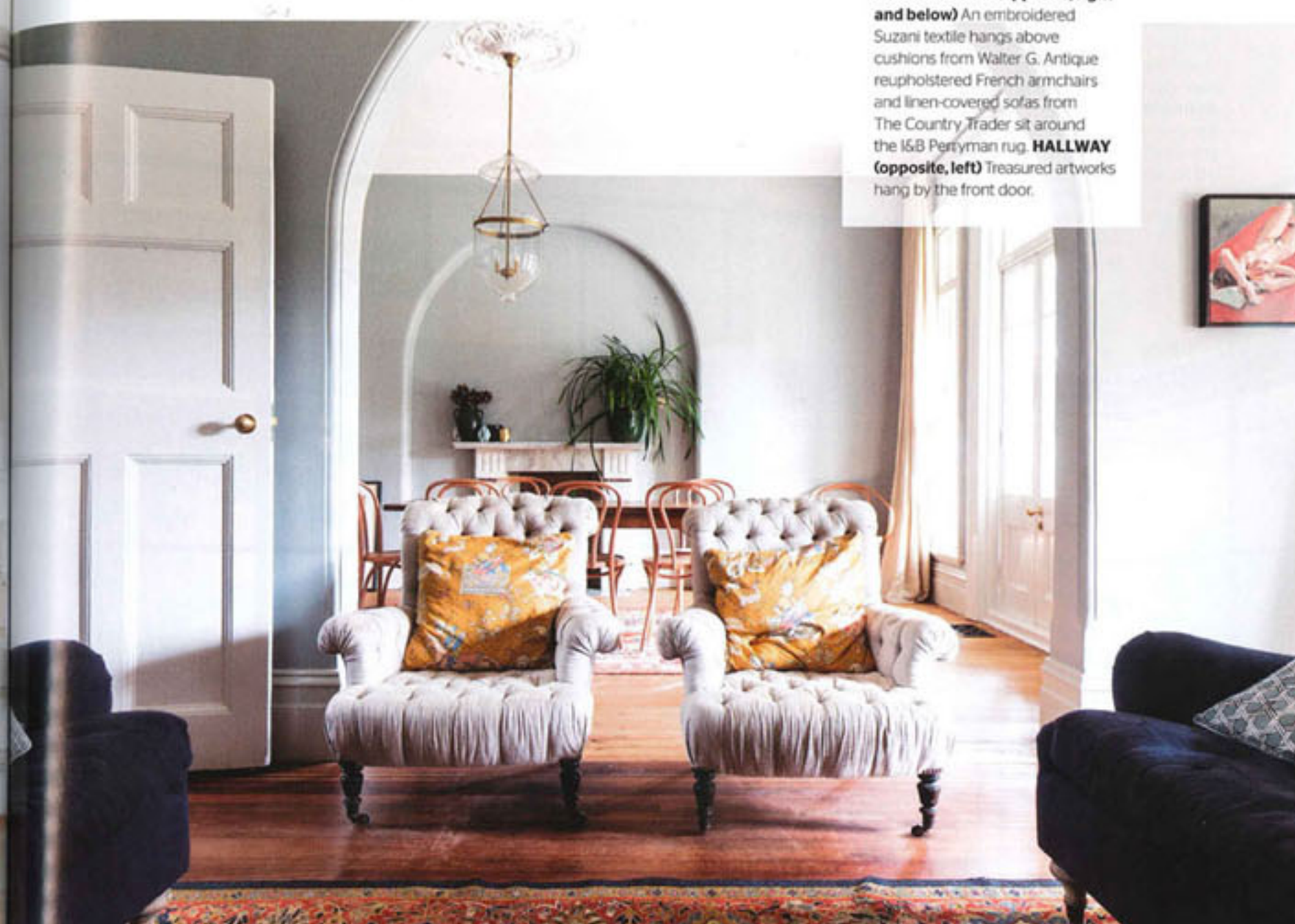
SITTING ROOM (opposite, right and below) An embroidered Suzani textile hangs above cushions from Walter G. Antique reupholstered French armchairs and linen-covered sofas from The Country Trader sit around the I&B Perryman rug. HALLWAY (opposite, left) Treasured artworks hang by the front door.

I didn't want it to be too open plan because that doesn't suit the style of the home. Ultimately, I saw this as a restoration rather than a renovation."