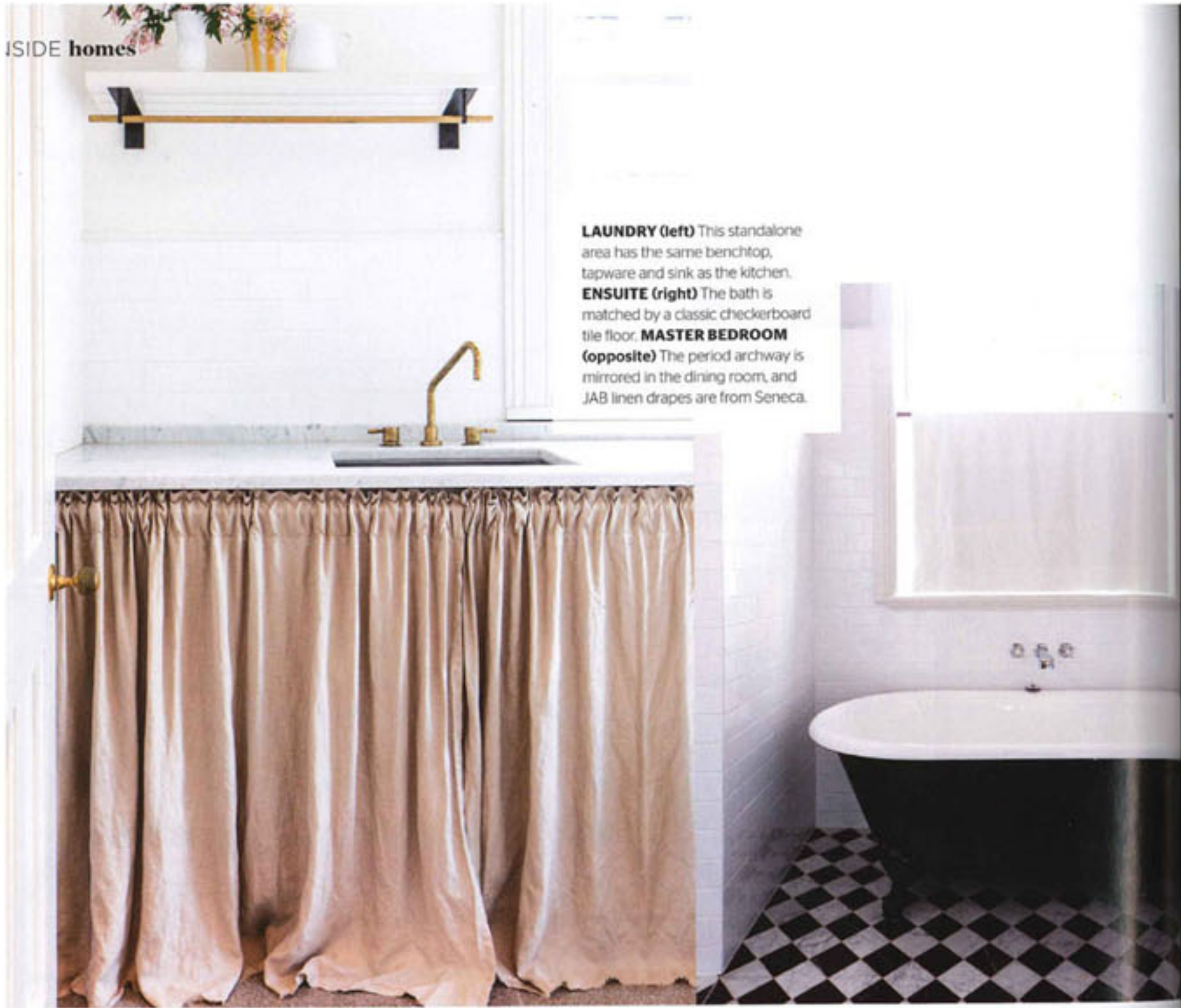
LAUNDRY (left) This standalone area has the same benchtop, tapware and sink as the kitchen. ENSUITE (right) The bath is matched by a classic checkerboard tile floor. MASTER BEDROOM (opposite) The period archway is mirrored in the dining room, and JAB linen drapes are from Seneca.