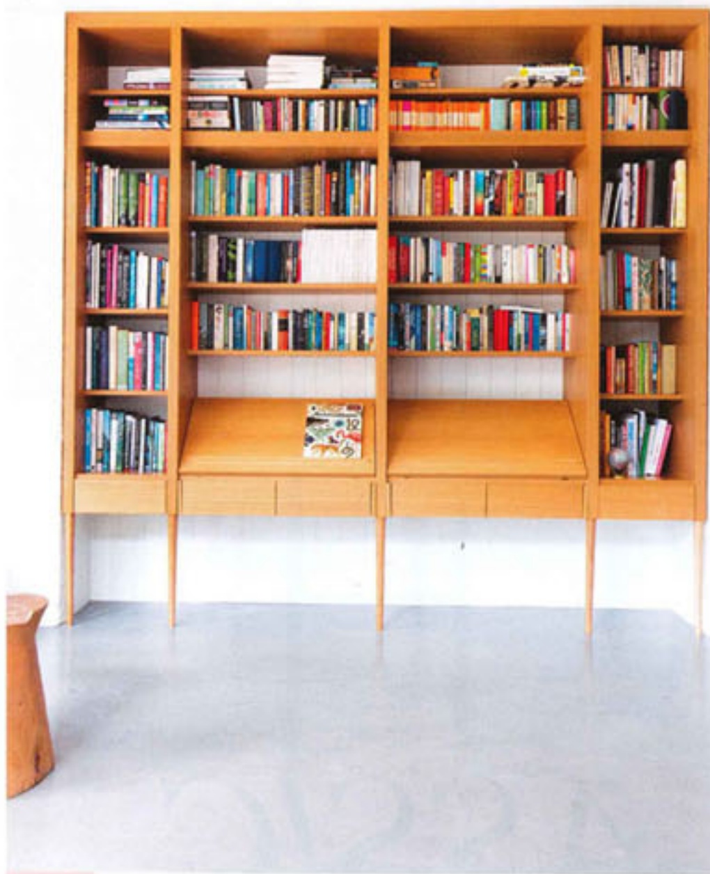
FAMILY ROOM (left) Polished concrete flooring in the extension is a practical solution with Fiona and Henry's four children. The custom-made bookcase incorporates the children's desks. KITCHEN (below) A four-door AGA cooker now stands where the original wood-fired stove once did.